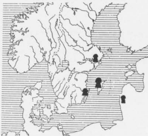
Fig. 1. Distribution of Gotlandic picture-stones. (After Nylén & Lamm 1988.)

from Grobin is a very delicate matter, and still more difficult for a person with little experience of this type of monument. Therefore it is no great wonder that I, who have done much work on them may have some objections to Petrenko's interpretation. These pertain to what he has identified as a sailing ship in the upper pictorial field. Already when I first saw