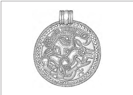
Fig. 5. An example of chronological group 3, identified by a dotted lower eyelid (AU) and a contoured beaded diadem below the hair (DX). Note that this is a late example of the horse's beard. IK 180 Stenholts Vang-C. Diameter c. 28 mm.

AU: Dotted lower eyelid (n=9). AN: Framed nose/eyebrow curve (n=2). DX: Contoured beaded diadem below hair (n=27). OD: D-shaped ear (n=10).