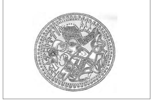
Fig. 4. An example of chronological group 2, identified by an eyebrow (AA) and a plait (HZ). Note that this is an early example of the horse's thrown-up hind leg. IK 58 Fünen-C. Diameter c. 37 mm.

AA: Eyebrow (n=19). HZ: Plait (n=8). HG: Smooth hairstyle (n=4).