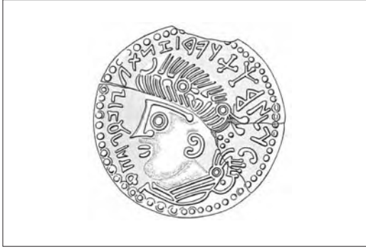
Fig. 3. An example of chronological group 1, identified by a central jewel in the diadem (JD) and a “de luxe” diadem (DP). IK 295 Lundeberg-A. Diam. C 23 mm.

JD: Central jewel in diadem (n=7). OB: B-shaped ear (n=2). DP: “De luxe” diadem (n=7).