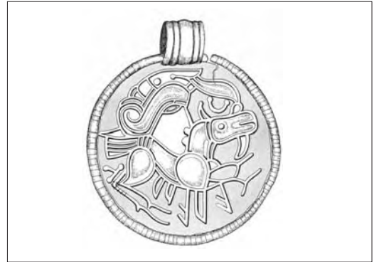
Fig. 6. An example of chronological group 4, identified by a relief hairstyle (HR) and a linear diadem below the hair (DZ). Note that this is an extremely late example of the horse's beard. IK 158 Sigerslev-C. Diameter c. 26 mm.

RQ: Chip carving (n=6). AD: Triangular eye (n=4). HR: Relief hairstyle (n=6). DZ: Linear diadem below hair (n=3).